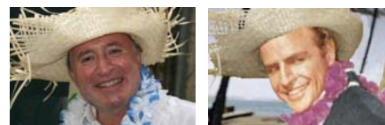
Marlon Brandon in "Mutiny on the Bounty"