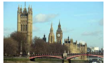
View of Westminster, London RadcliffesLeBrasseur are based in Great College Street, just South of Parliament Square and opposite the Houses of Parliament.