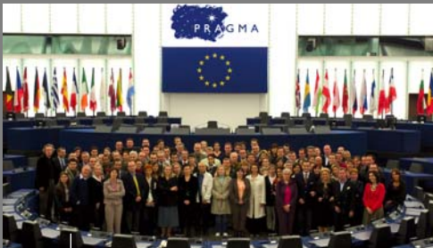
Hemicycle of the European Parliament