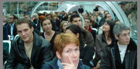
Sightseeing tour of Strasbourg by boat