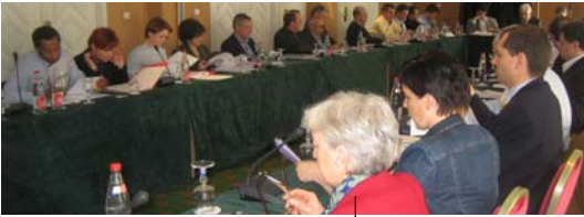
Meeting of partners