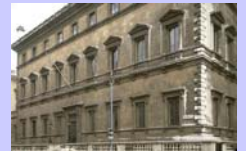
Reform Club, London

20th, 21st and 22nd October 2006 in Genoa (Italy): Annual Conference