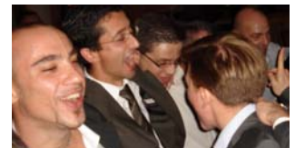
Dance at Portofino Kulm