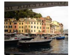
Portofino by boat