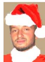
Fabio Colombo Interconsulting Milan, Italy