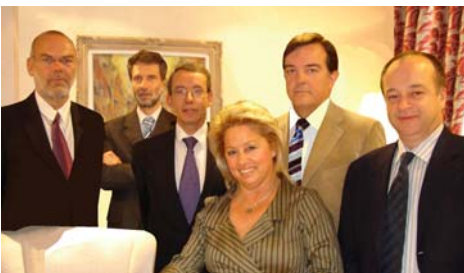
Pragma's Board wishes you a Merry Christmas and a Happy New Year