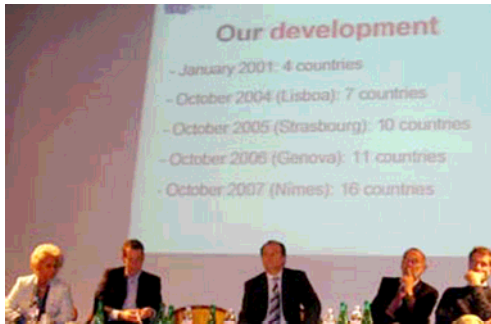
Members of the Board during our conference in Nîmes in October 2007

After 7 years of existence, Pragma has entered a new phase of development, as shown by the following figures: