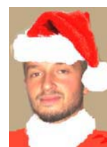
Fabio Colombo Interconsulting Milan, Italy