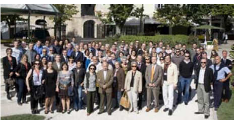
Group picture of people who attended Pragma's 2009 annual conference in Burgundy

Many thanks also to Pragma members and contacts coming from distant countries like Argentina, Brazil, Chile and Mexico.