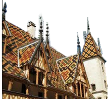
Hôtel-Dieu, Beaune, France

International network of law firms www.pragma-eu.com